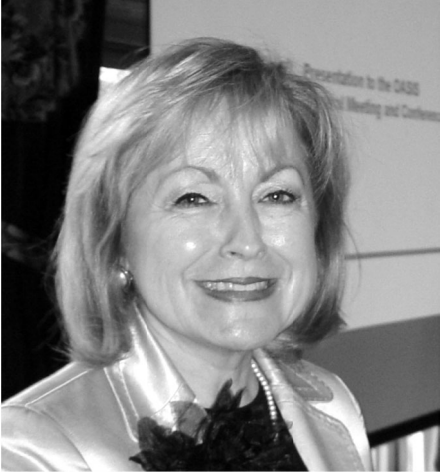
The Honorable Minister Madame Meilleur Minister of Community and Social Services

The Minister also highlighted the just released "Opportunities and Action Report" about transforming support in Ontario for people who have a developmental disability.