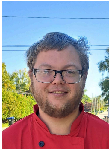
Liam Russell Influencer