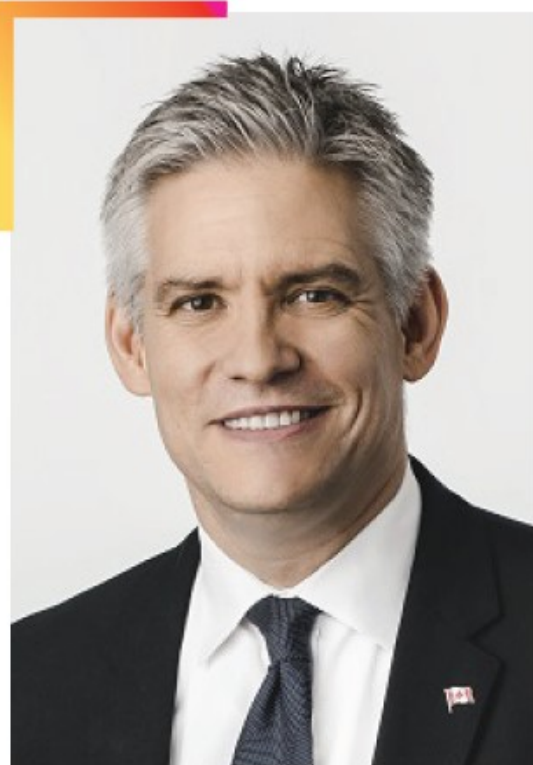
The Hon. Mike Lake, P.C. M.P. for Edmonton—Wetaskiwin