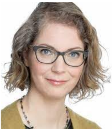
Developmental Disabilities Primary Care Program: Healthcare Tools for the Care of Adults with Intellectual and Developmental Disabilities

This session will explore why we need to reimagine governance, including new research on the trends and forces impacting its design. It will also share a novel way of looking at governance through the lens of a complex system. Participants will take away a framework for governance that can be used to stimulate generative conversations within their own organization.