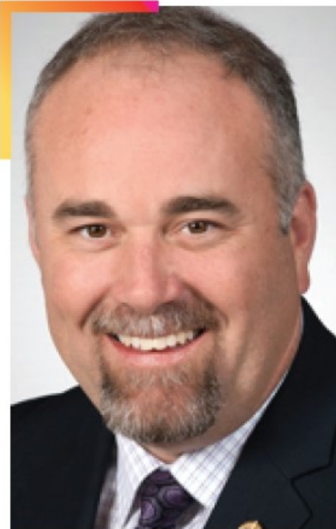
The Hon. Todd Smith, M.P.P. for Bay of Quinte and Ontario Minister of Children, Community and Social Services.